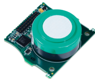
AG01 CO sensing element

Note: It is important to check your local building code for sensor location and coverage requirements prior to installation.