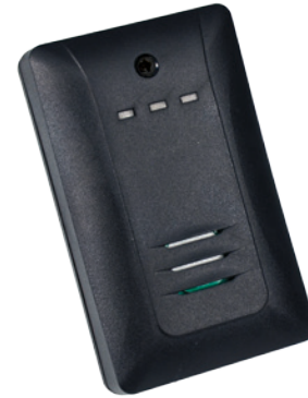
GWN Gas Sensor Platform & GWNP Protocol Gas Platform for Gas Sensors

The GWNx Series platform, along with the AG01 carbon monoxide (CO) sensor or AG02 nitrogen dioxide (NO 2 ) sensor, offers a convenient means for sensing gases in the environment. The GWNx is mounted to a single-gang electrical box and wired to the building controller. A single AG01 or AG02 sensor (sold separately) is installed in the GWNx. With this design, there is no need for costly new installation when a sensor reaches the end of its life. The GWNx platform remains installed and the installer simply opens the GWNx housing to replace the modular sensor inside, reducing labor costs and downtime.