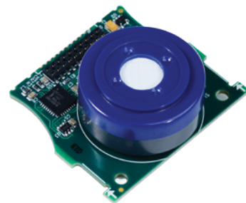
AG02 NO 2 sensing element

The information provided herein is intended to supplement the knowledge required of an electrician trained in high voltage installations. There is no intent to foresee all possible variables in individual situations, nor to provide training needed to perform these tasks. The installer is ultimately responsible for ensuring that a particular installation remains safe and operable under the specific conditions encountered.